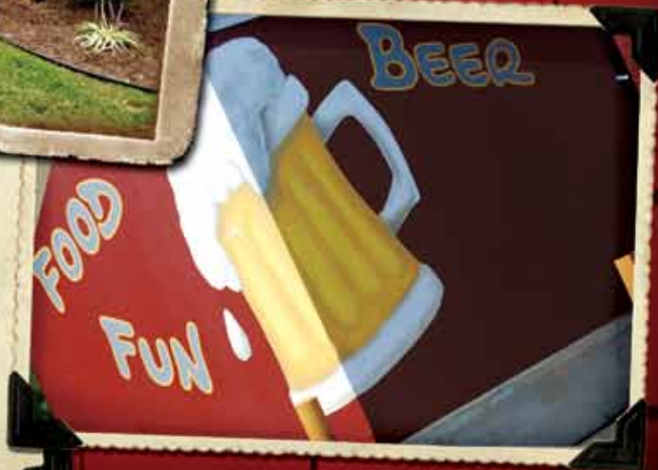
Rams Head Tavern, Annapolis Annapolis, MD Est. 1989